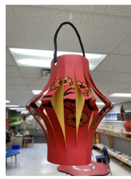
Kindergarten Lunar New Year Lanterns