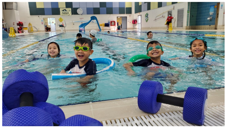
Grade 3s at their first swimming lesson.