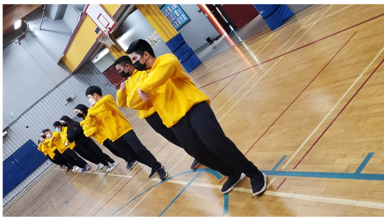
Grade 7P learning their hip hop routine.