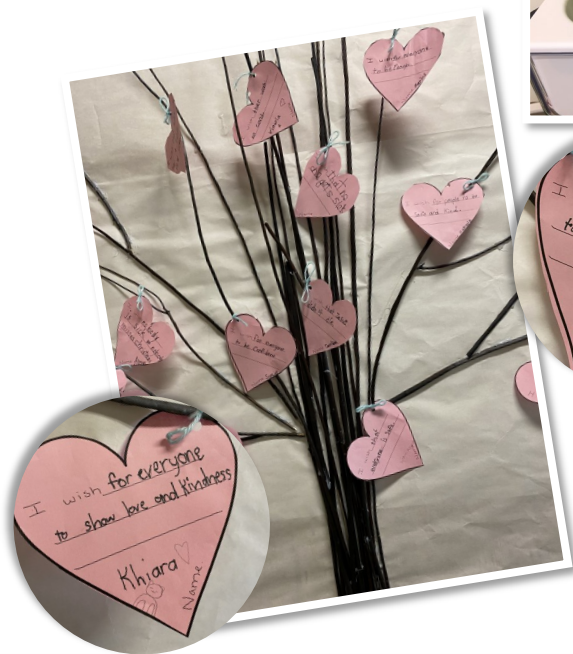
Grade 2MB's wishes for the New Year based on the book The Wish Tree (left)