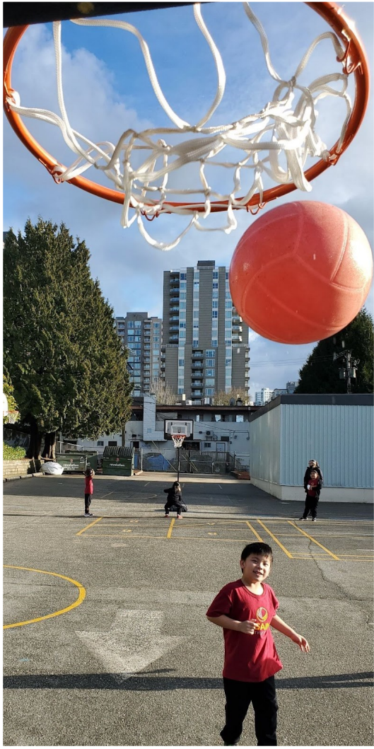
Getting some basketball practice outdoors in the sunshine!