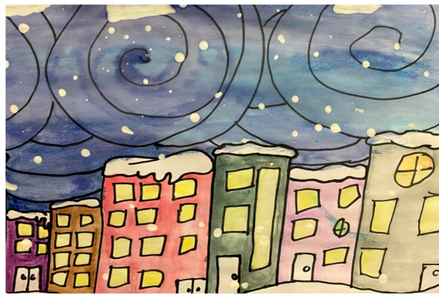
Grade 5SR Snowy City Scenes inspired by Van Gogh