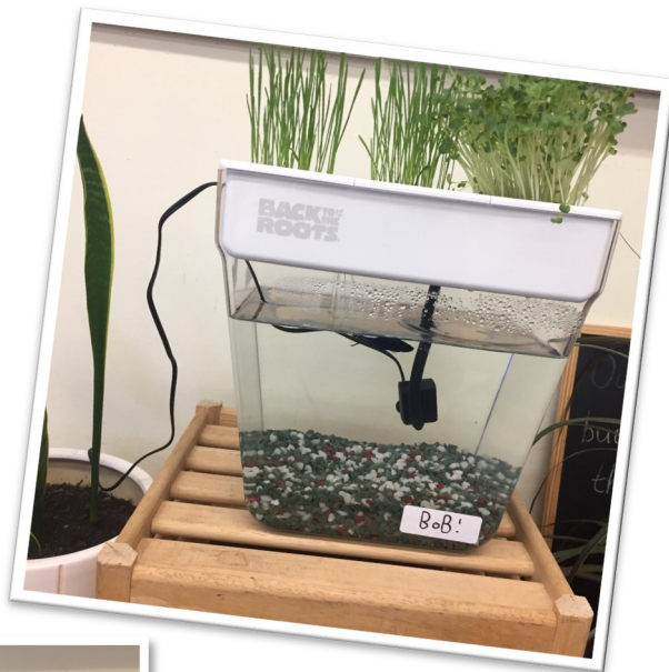
Grade 4's Water Garden

The Grade 4's are learning about an Aquaponic Ecosystem, a closed-loop ecosystem that raises fish and grows plants! It is a sustainable & efficient way to grow food & it uses 90% less water than traditional farming. As you can see our plants have already started growing. Soon we will be eating radish microgreens and wheatgrass. Our beta fish is a great addition to our class. His name is Bob!