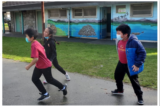
Happy to be playing with friends!