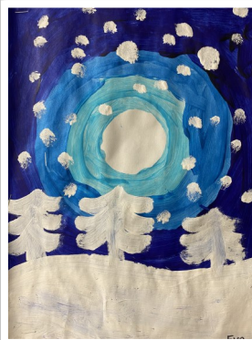
Kindergarten winter trees in cool colours