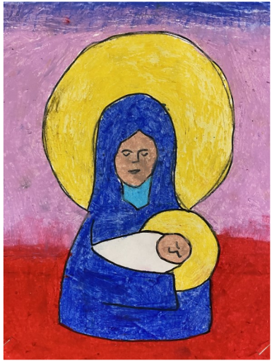
Grade 5L Madonna and Child