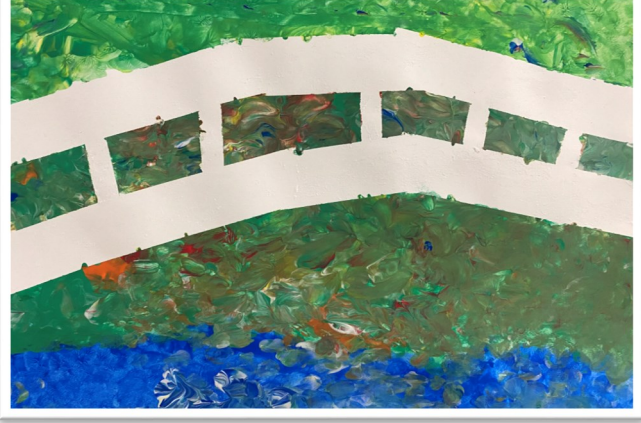
Grade 3 artwork inspired by Claude Monet's Bridge over a Pond of Water Lilies