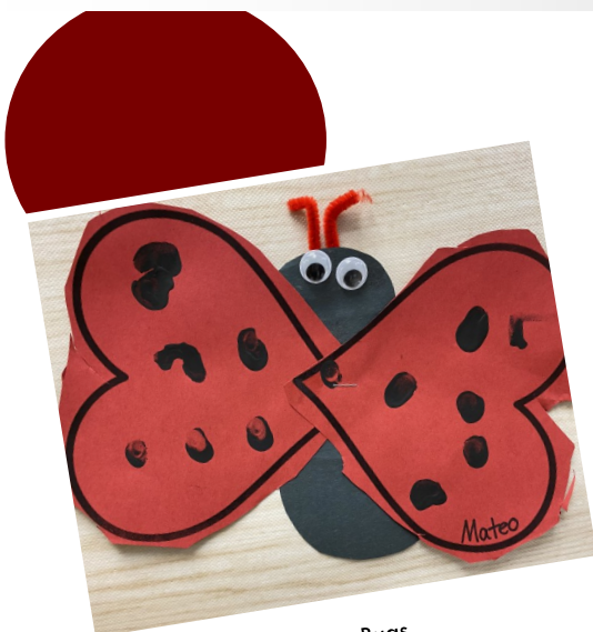
Kindergarten Love Bugs

On Monday, students will be given a chance to express their gratitude to those who make their Catholic education possible, including parents and staff. On Tuesday, classes will watch a video and participate in a trivia contest to test their growing knowledge of St. Dominic and our Church – with prizes for the primary and intermediate class winners! On Wednesday during our monthly school Mass, we will focus on St. Dominic and the Dominican friars who serve St. Mary's. Each priest will be presented with a “spiritual bouquet” which every class will help to create. Thursday and Friday, staff members will attend the Catholic Educator's Conference so students will have an extra long weekend to enjoy!