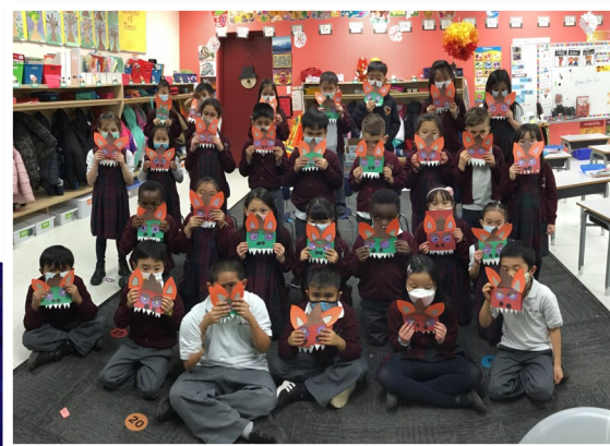
Grade 1 Lunar New Year—Year of the Tiger