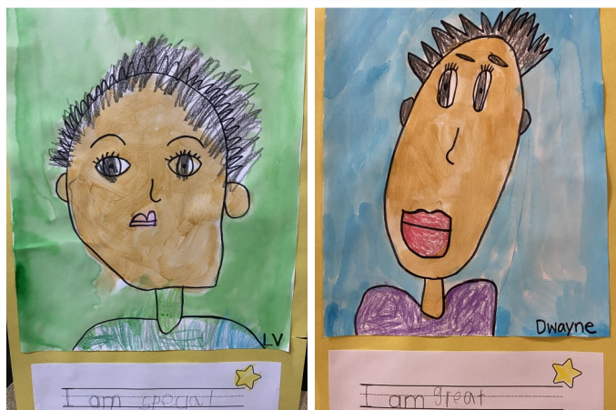
Kindergarten self-portraits; expressing themselves in positive ways