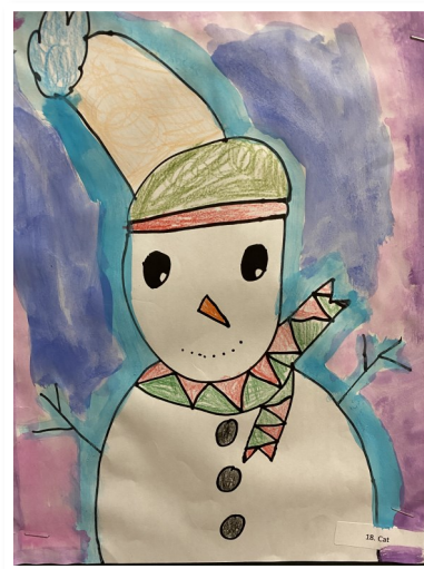
Grade 1 snowmen painting lesson with outlines and geometric patterns